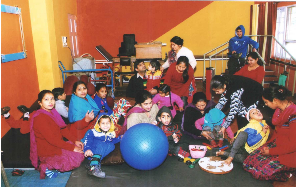
Physiotherapy Unit at DIET Mandi