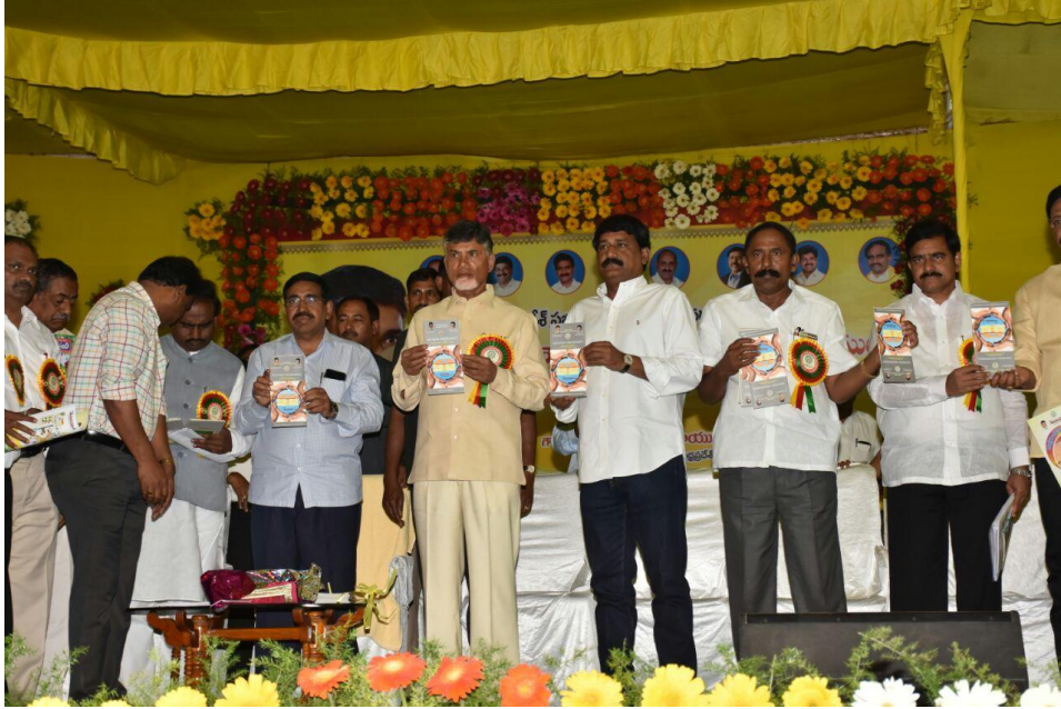
Hon'ble Chief Minister Sri Nara Chandrababu Naidu inaugurates Brochure on Badi Runam Thirchukundam

(Successful practice to mobilize community for participation and involvement)