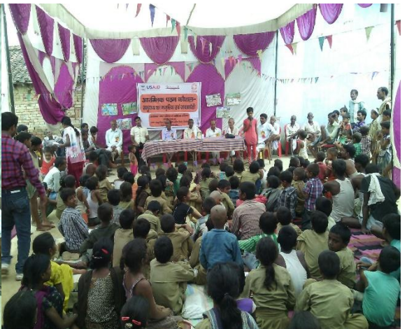
Events organised at Community