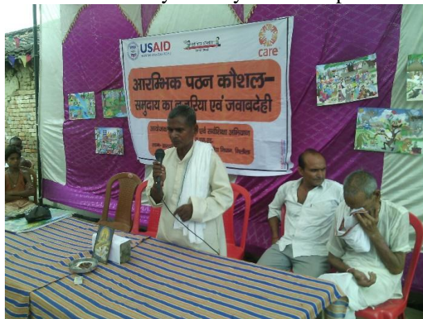
Community Participation in the event.