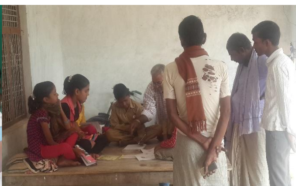
Children Reading Books & Community Watching