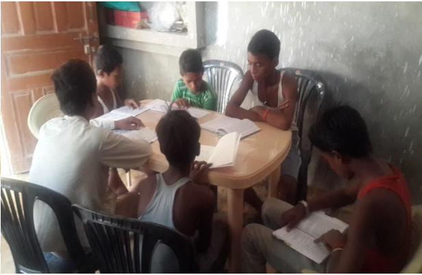
Children Reading Books