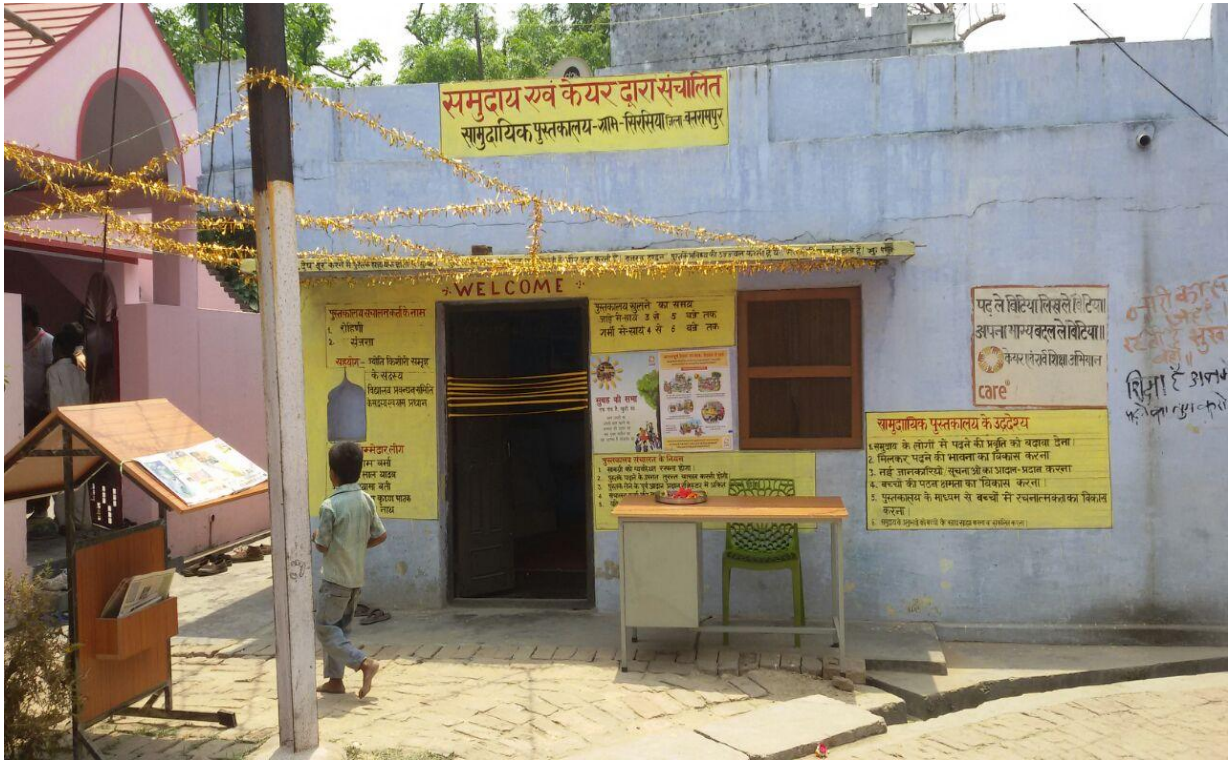
Community Library at Balrampur