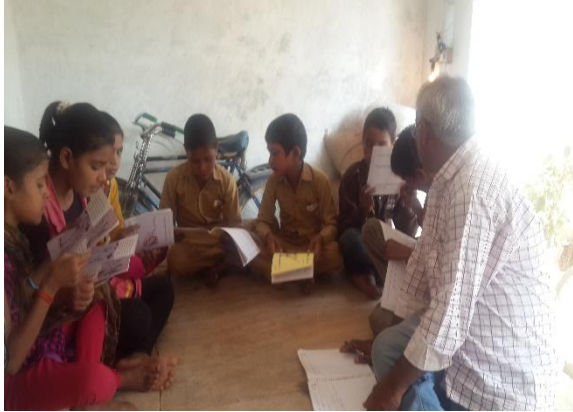
Children Reading Books