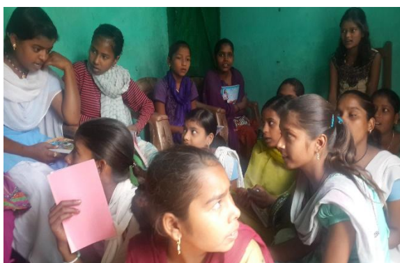
Girls Collectives in Library