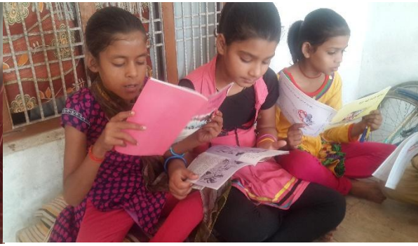
Children Reading Books