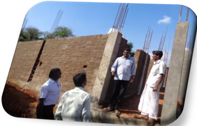
District Coordinator Visiting the Construction of New Primary, Velampatty , Anthiyur