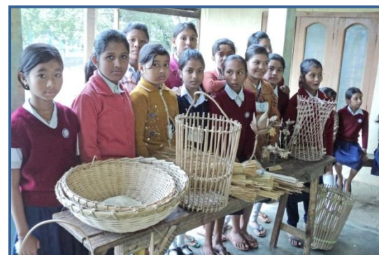
Pic 1 – Handicrafts developed by Student