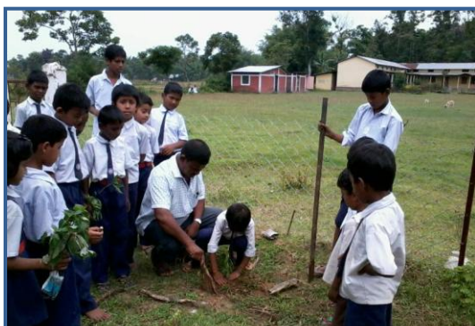
Pic 2– Tree Plantation by student