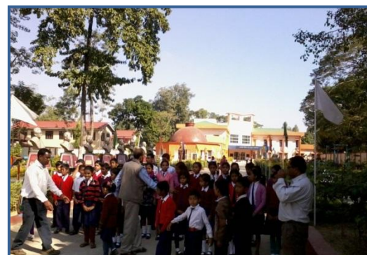
Pic 3 – Education trip for student