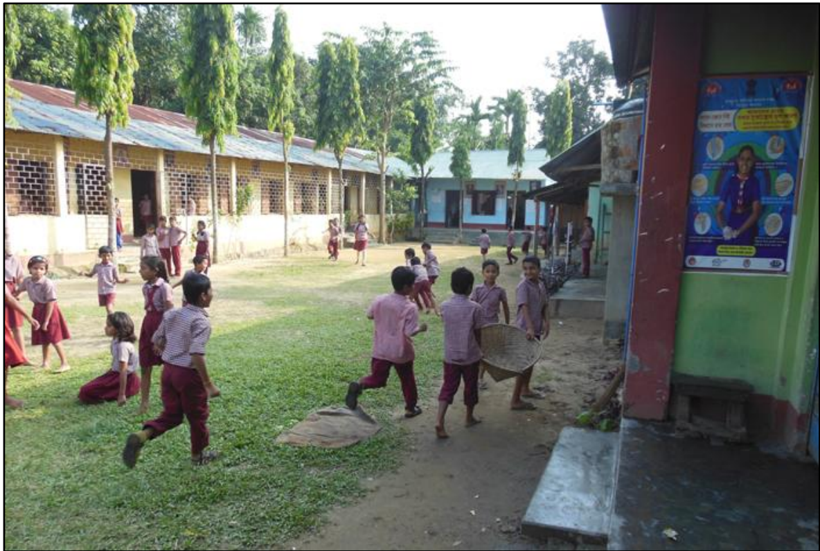
Cleaning of school premises as a part of Swachh Bharat Swachh Vidyalaya Abhiyan