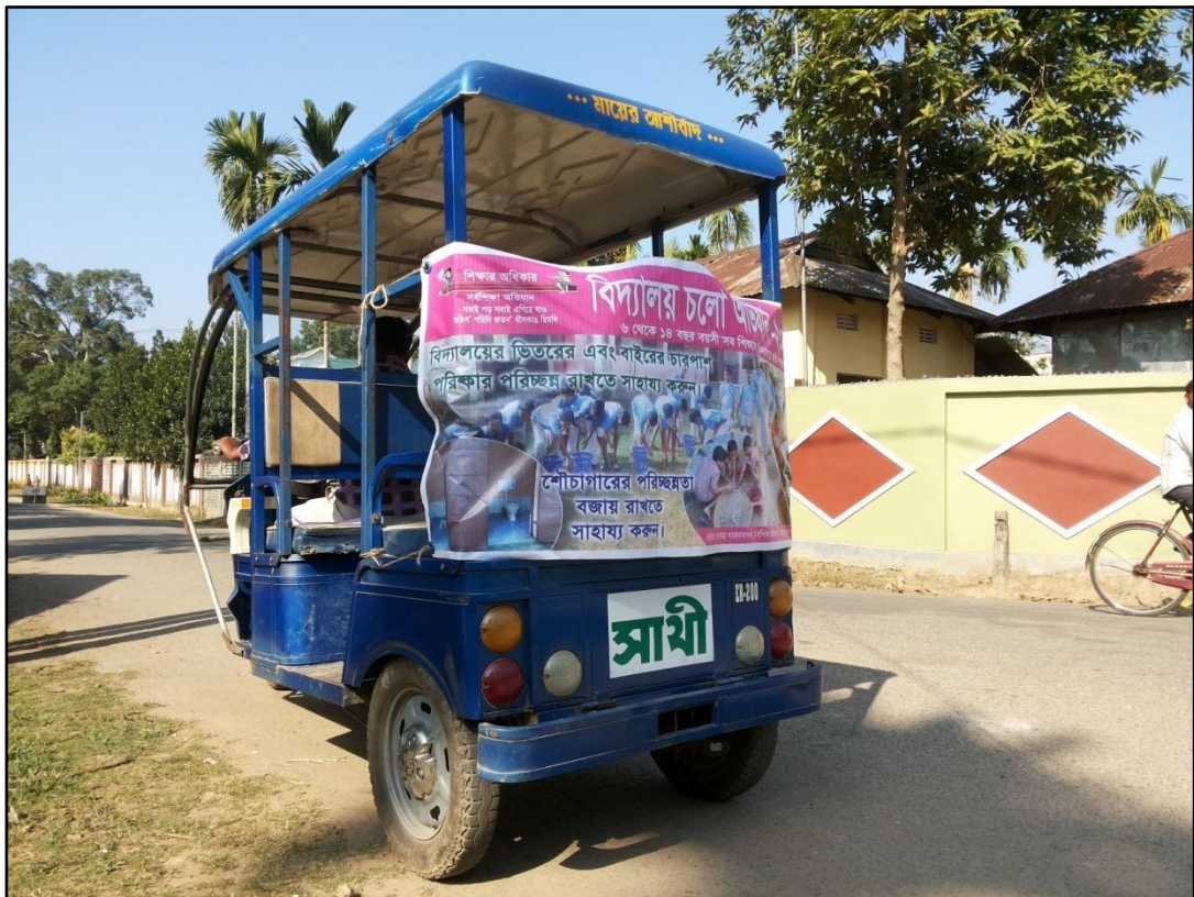
Awareness generation on Swachh Bharat Swachh Vidyalaya Abhiyan