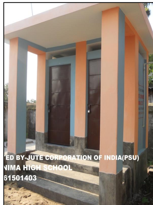
Toilets constructed by PSU as part of Swachh Bharat Swachh Vidyalaya Abhiyan