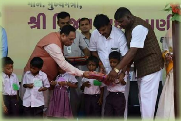
Hon'ble Chief Minister enrolled children in std. 1 st

In particular the Kanya Kelavani is the move in the right direction for 'Education for All.' A flagship program of the State Government entered the ninth year encouraging formal education with special focus on the girls, also authorities claim to achieve 0% dropout rates in Gujarat in coming years.