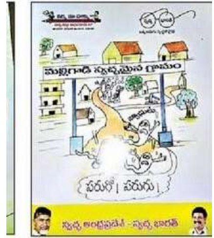
మల్లిగాడి స్వచ్ఛమైన గ్రామం

The book is available at: http://ssa.ap.gov.in/SSA/news.do?mode=viewStatistics&transfer&filename=MalligaaduMaruguDoddi.pdf