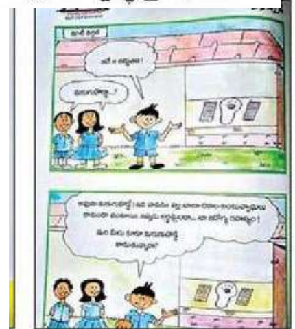
మల్లిగాడు వాడుతున్న మరుగుదొడ్డి