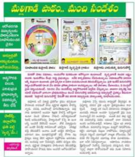
News coverage in leading Telugu news papers in Andhra Pradesh