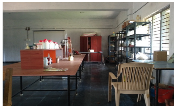
ZPHS, LN Peta Science Lab