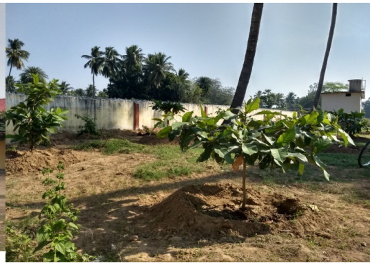
In & around Greenery