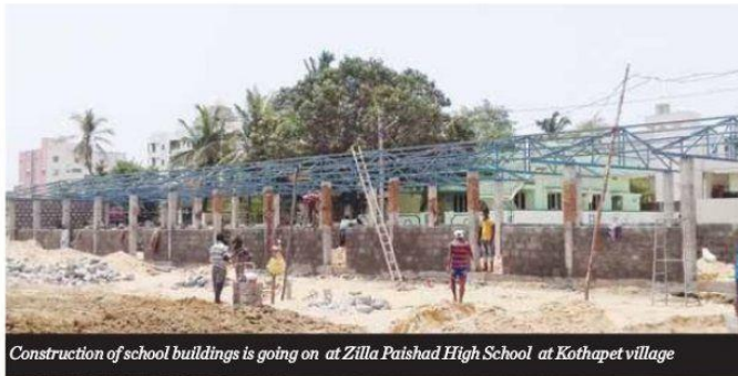
Construction of school buildings is going on at Zilla Parishad High School at Kothapet village