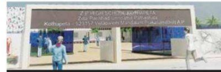
An imaginary photo of Zilla Parishad High School at Kothapet village near Chirala which would look this after completion of construction