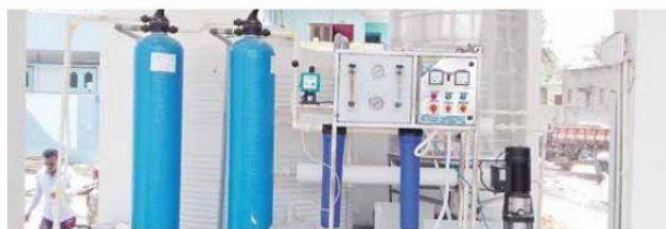
An imaginary photo of water purified plant which will be set up on the school premises