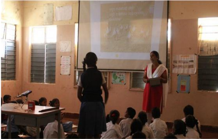
A class at GPHS Jeevan Bheema Nagar( Bengaluru) using the app and resources provided by Meghshala

It is an 8th grade science class. Students are learning the concepts of Force and Pressure. The lesson starts off with activities, involving them in a game —a tug of war or arm wrestling each other. Throughout the lesson, there are several images and videos that demonstrate the concepts.