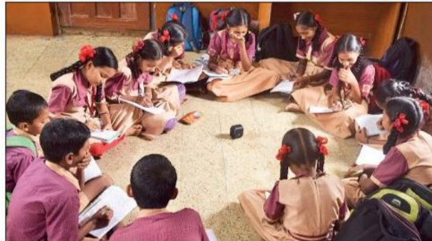
TELE-TEACHERS: Students in Talasari get phone lessons from tutors they have never met as part of the 'Read A Story' initiative