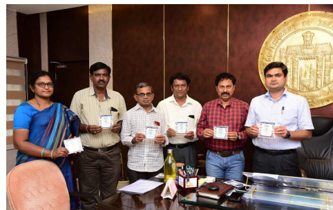
CD released by Karimnagar Collector

Further 100 CDs were arranged to the Director, SCERT to share the content with other 32 districts in the Telangana State by sending 3 CDs to each district.