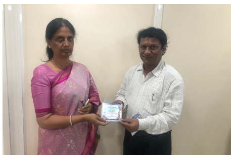
CD released by Education Minister & DEO

All star marked poems of classes from 6 th to 10 th of Telugu Subject were read by these expert teachers and prepared around 500 CDs. All these CDs were given freely to all govt upper primary and high schools in the district. This CD stands as TLM for teachers and as well as students in “PADYA PATHANAM”, which means how to read a poem. It was informed to play this CD during intervals in schools, so that children can hear them and recite poems unknowingly.