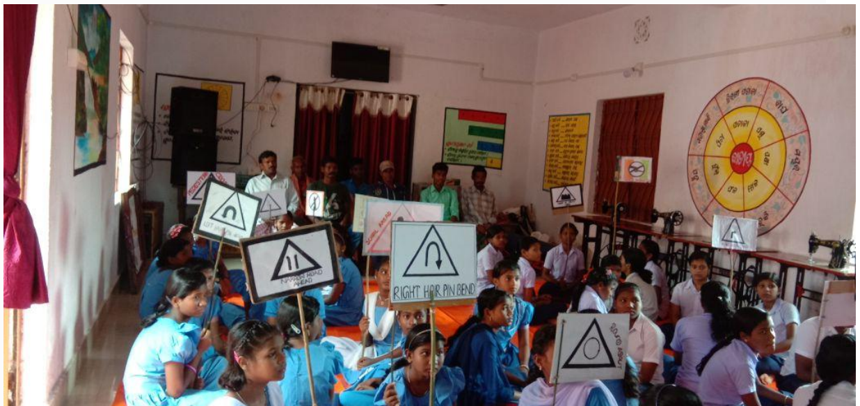
Khuard UPS, Balasore