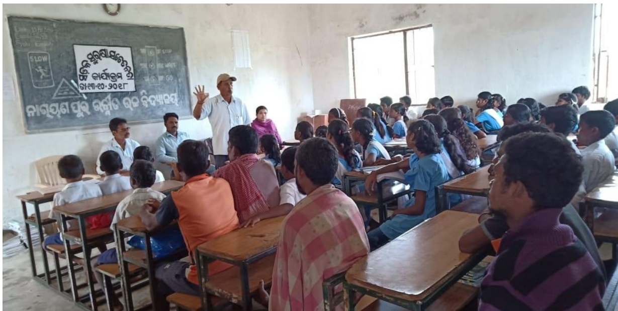
Narayanpur UGUP, Rayagada