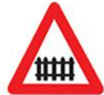
Manned railway gate