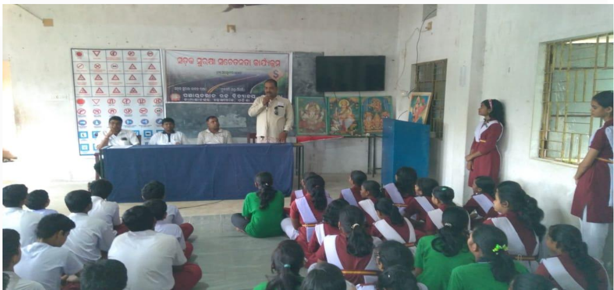
Panchayt H.S, Dhenkanal