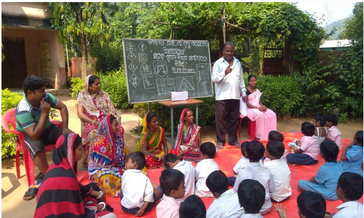
MV -36 P. S, Malkangiri