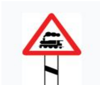
Unmanned railway gate