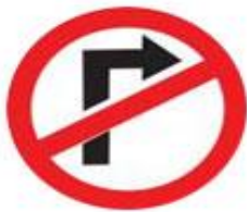
Right Turn Prohibited