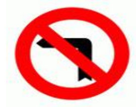
Left Turn Prohibited