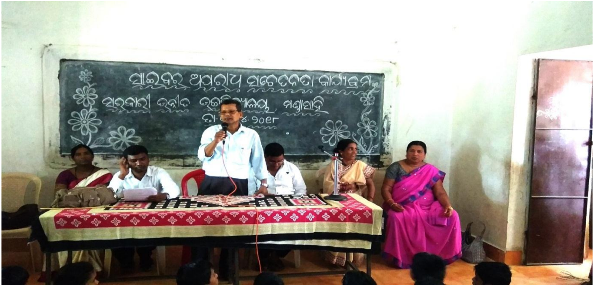
Govt. Upgraded High School, Mandasahi, Jagatsinghpur