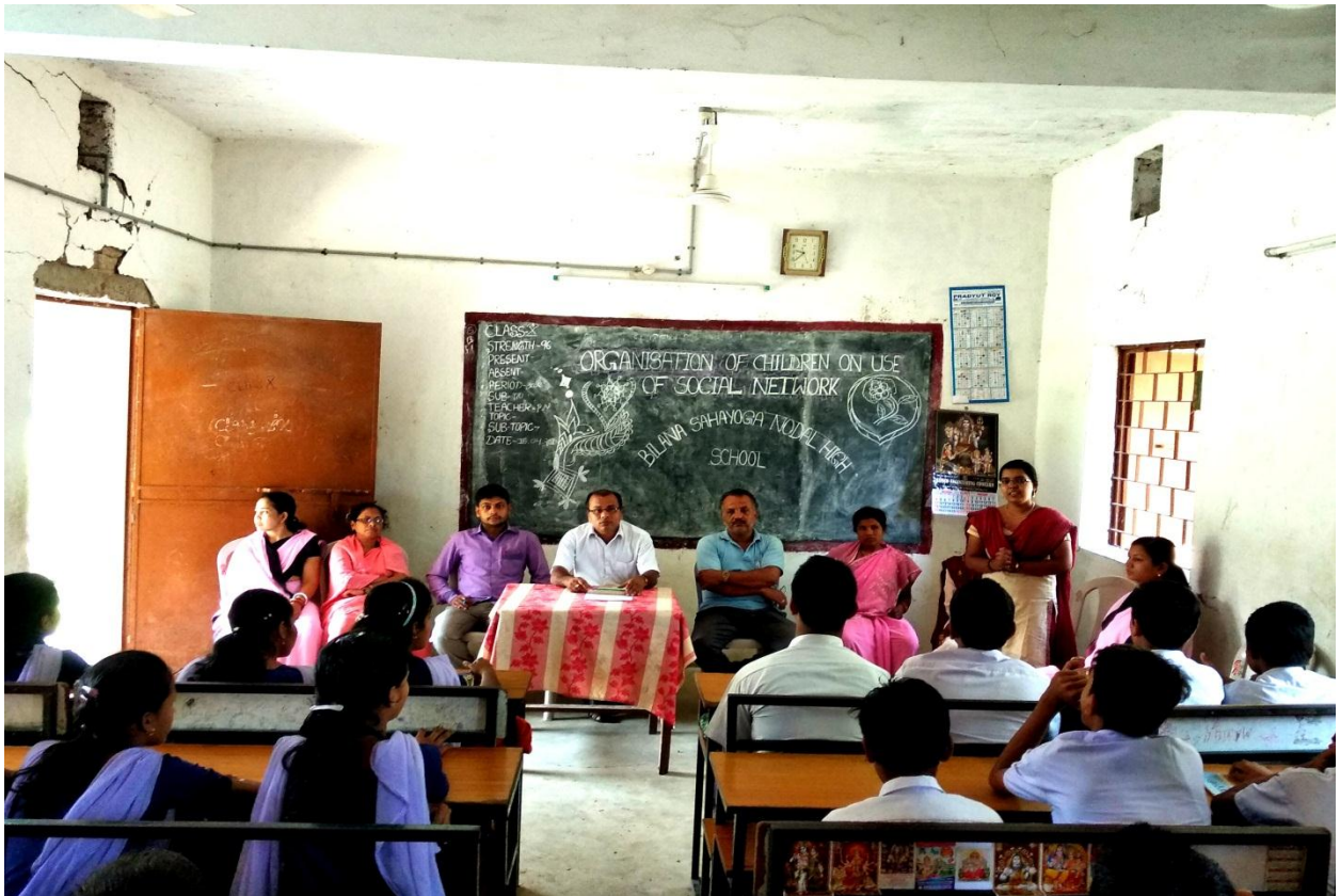
Bilana Sahayog Nodal High School, Bhadrak, Odisha