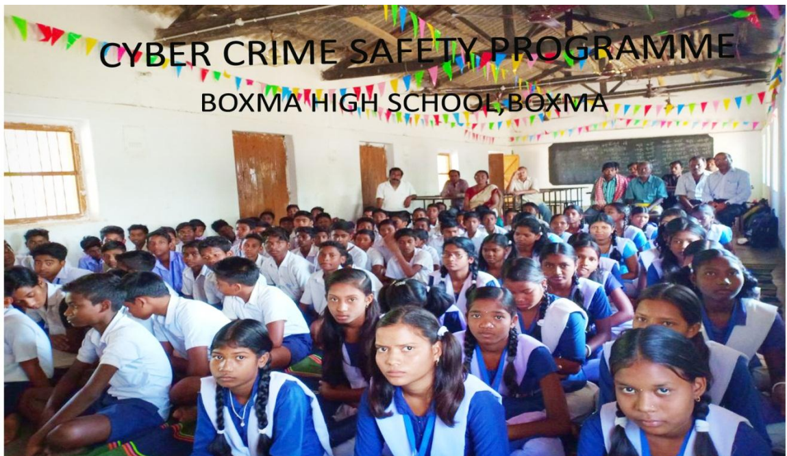
Boxma High School, Sambalpur

Direct sharing with the children will have a better result than any other means. In order to disseminate the message directly to the target group, a detail discussion points were developed and circulated to all the Upper primary as well as High schools with a clear cut instructions regarding mode of transaction. The said programme was organized in all upper primary schools as well as in High schools on 17 th April 2018. All the children from class VI to X along with their parents participated in the programme. A total 22679 number of schools have been covered under this programme. Different issues regarding safety of the children on use of social network are given below: