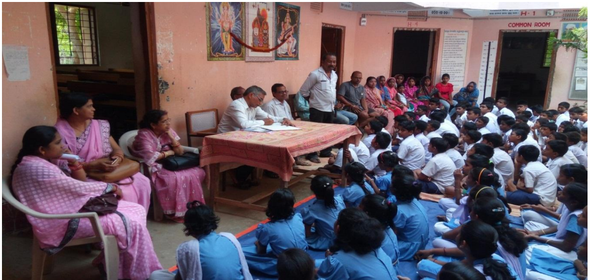
Jagannath Vidyamandir, Jagatsinghpur, Odisha