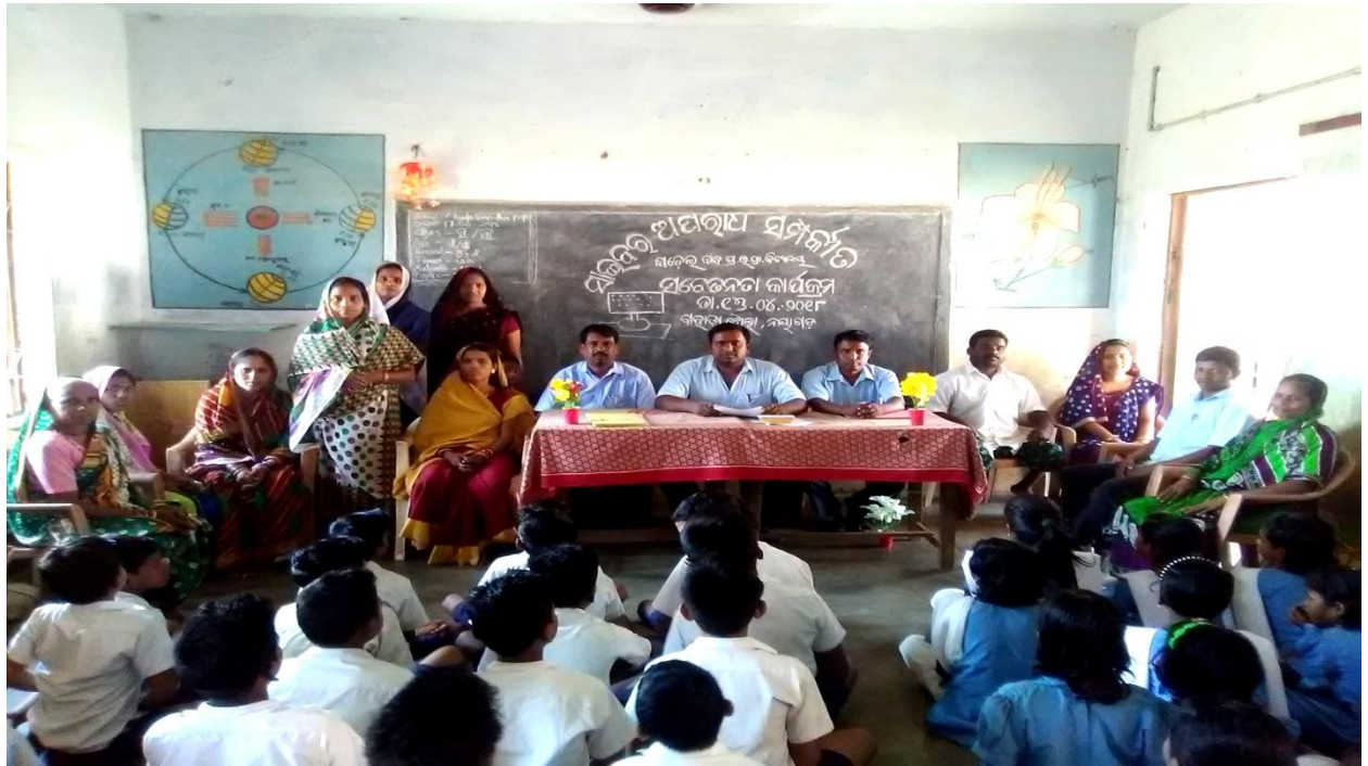
Bahada Jhola Govt ME, Nayagarh, Odisha