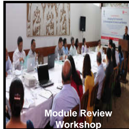
Module Review Workshop