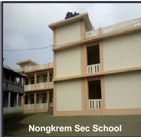
Nongkrem Sec School