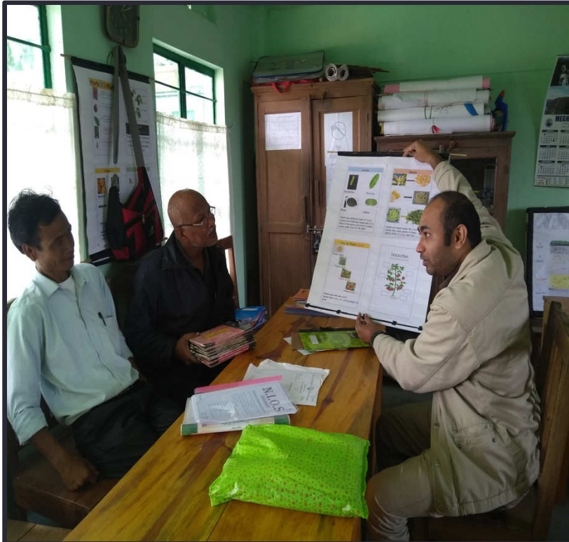
Interactions during On job Training visits to schools