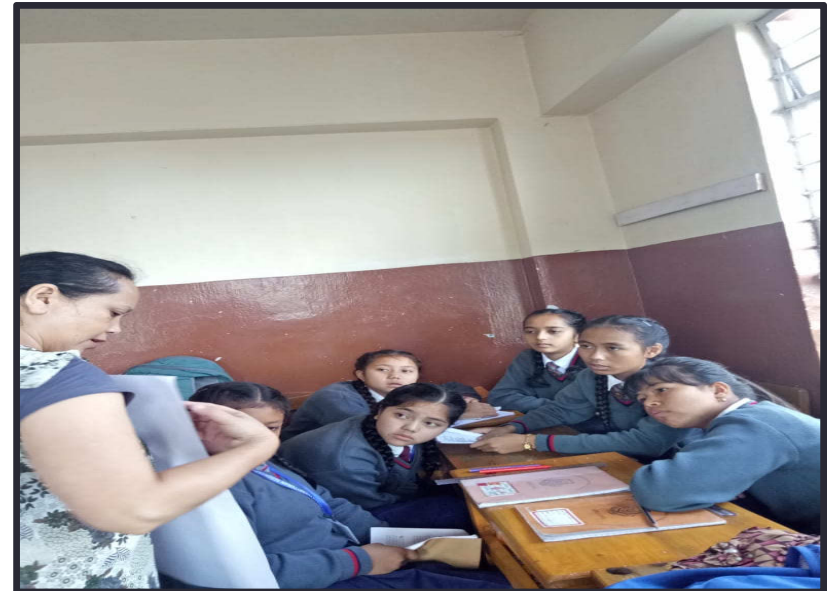
Teacher trying out new teaching methods post training