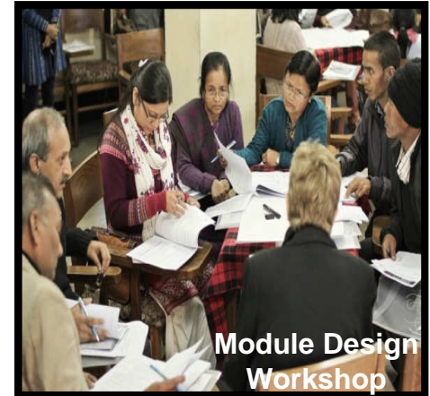
Module Design Workshop