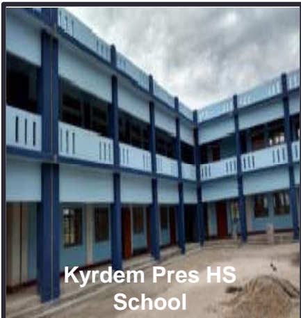
Kyrdem Pres HS School