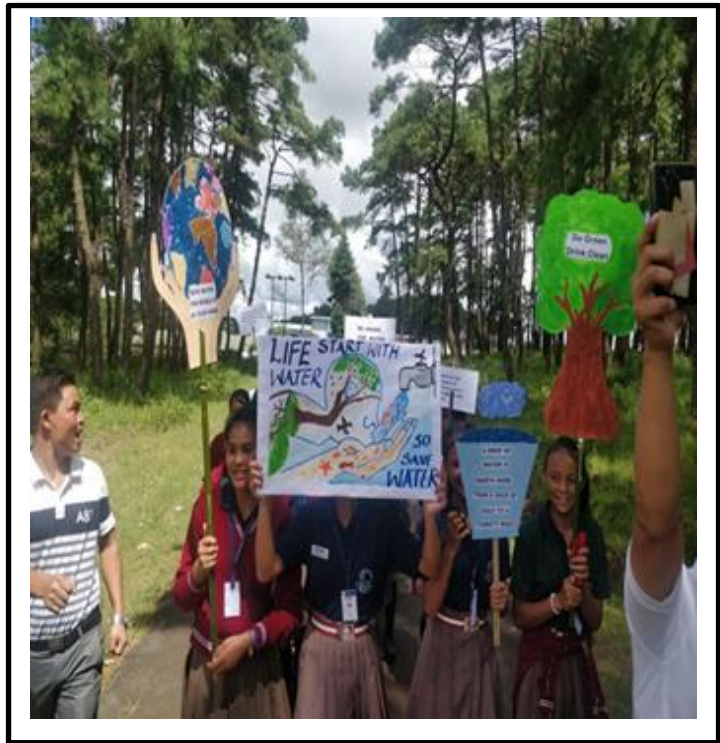
Marching towards a cleaner and healthier environment – Students engaged in Cleanliness Drive (left) and Hand Wash Drive (right)