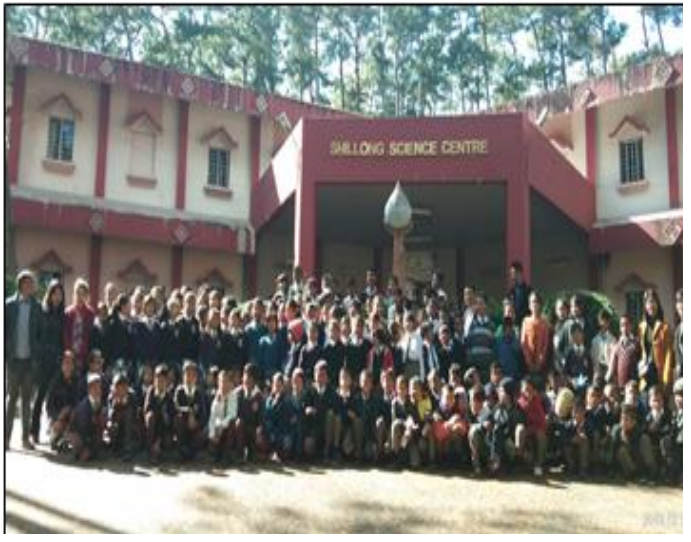
Students Exposure Visit (left) and Science Model demonstration by students in front of Bharti Foundation's Co-Chairman (right)