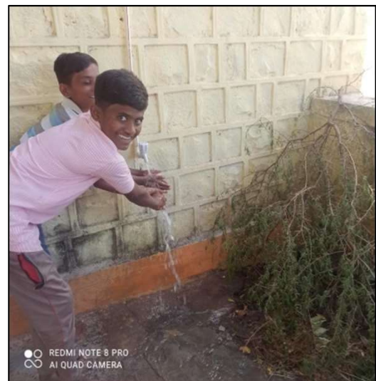
Fig-2: Children using tap in handwashing area