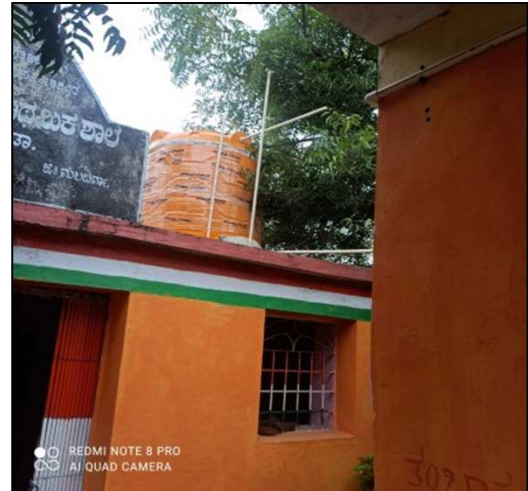
Fig-1: Overhead Tank with 1000 lts. capacity

To meet the water needs of the school, a borewell was installed in February 2020 within the school premises and water was drawn from it with the help of a motor. Though water was sufficiently available, the school lacked continuous water supply to the kitchen area as well as toilets. In November 2020, when Mr Raghavendra, Headmaster of the school received information on the launch of 100 days campaign under Jal Jeevan Mission to provide piped water supply to the school, he approached the gram panchayat with an application to provide the facilities to his school. His efforts were supported by the block and district officials by sending a request to Zilla Panchayat to provide continuous water supply to the school. This was approved by the gram panchayat and the school was provided with a 1000 litre overhead tank, 0.5 hp motor and pipelines and taps in kitchen, toilets and handwashing area.