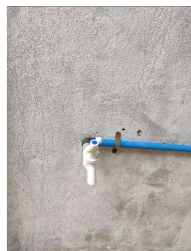
Fig-3 : Water pipe connection to the handwash unit