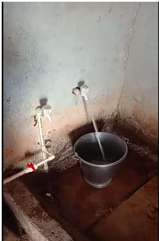
Fig-2: Accessibility of water to toilets