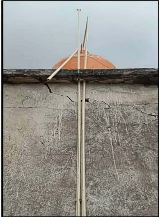
Fig-1: Newly installed overhead tank