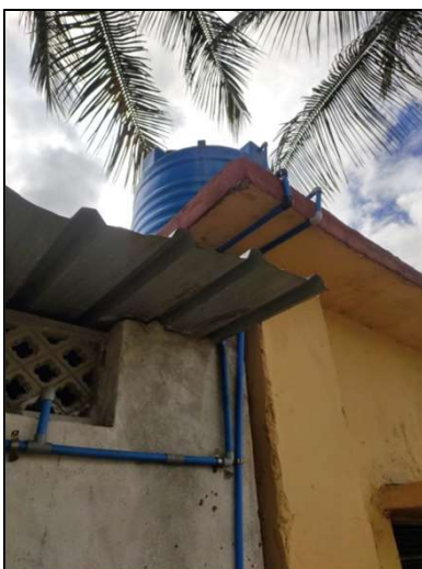
Fig-1: Nelwy installed over-head tank

As the pipelines are drawn from the main pipeline, the school authorities are confident of getting uninterrupted water supply. JJM has helped the school in getting continuous water supply.